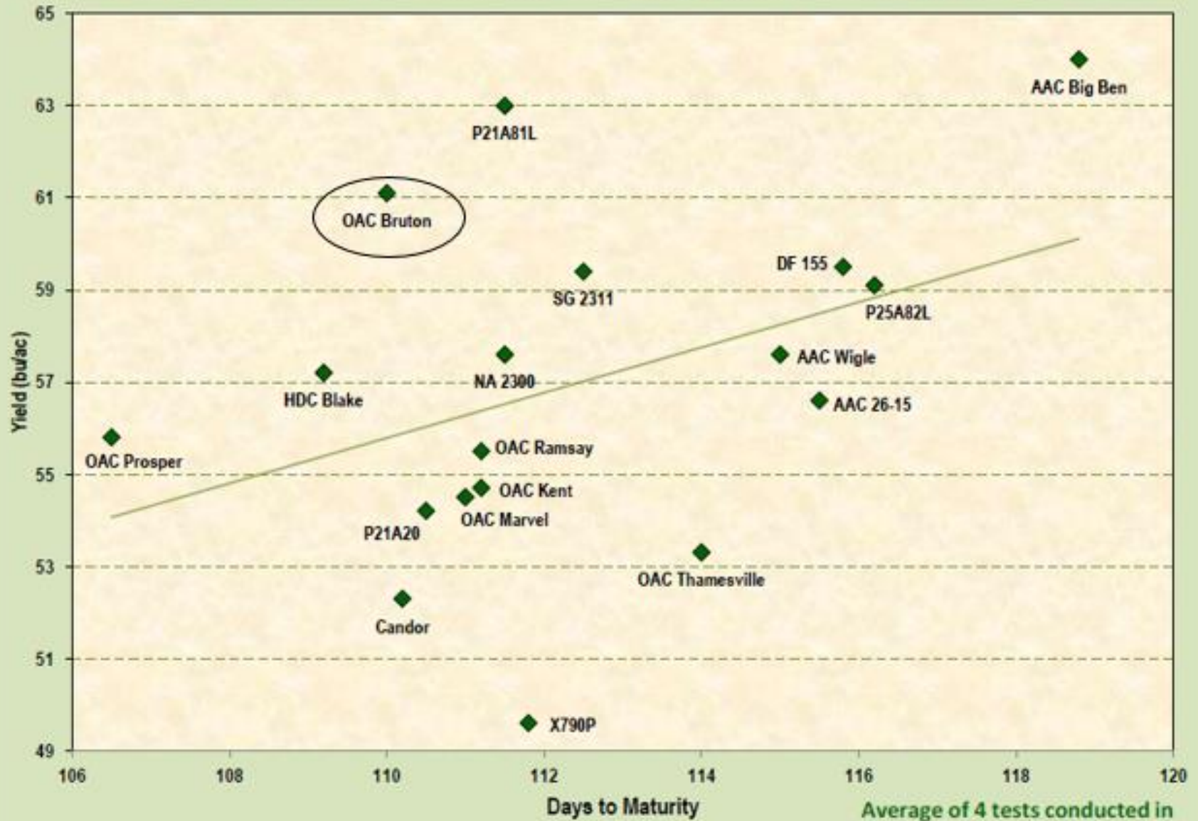
Ontario Early MG2 (2900-3300 HU) Areas, OSACC 2 Yr. Clay Conventional Summary (2018-2019)

Average of 4 tests conducted in Inwood and Palmyra