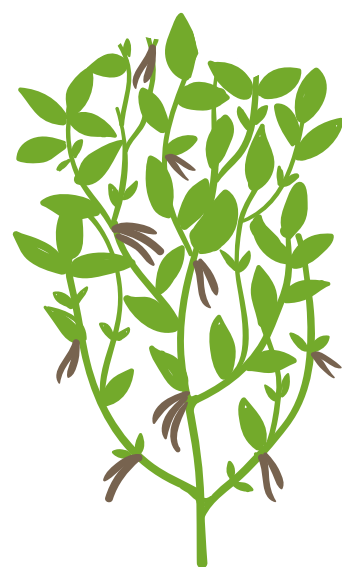
Narrow Canopy Medium Height